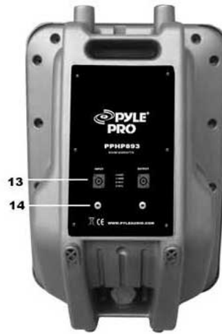
PPHP1093/PPHP893 BACK VIEW